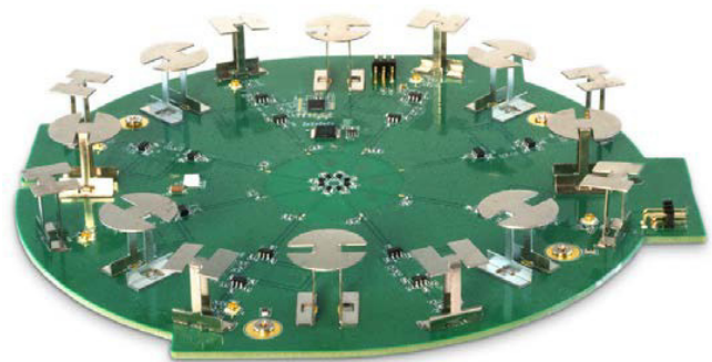
Bluetooth Antenna Array

vBLE enables businesses to provide rich location-based experiences that are engaging, accurate, real-time, and scalable.